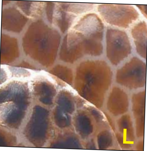
L You don't have to travel all the way to Africa to see these spots!