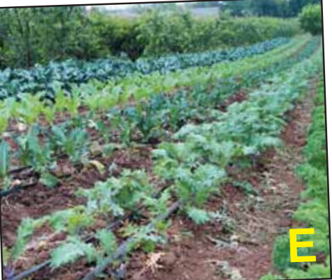
E We grow more than 100 varieties of fruits and vegetables. How many can you find?