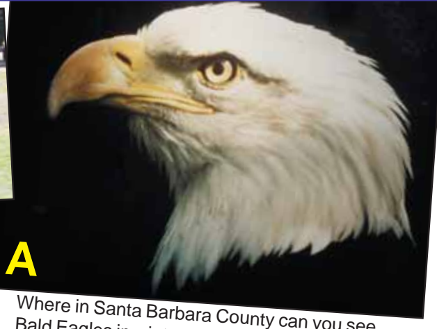
A Where in Santa Barbara County can you see Bald Eagles in winter?