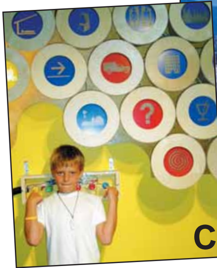
C Where can you climb a tower, crawl through a tunnel, and send messages by pushing color coded buttons?