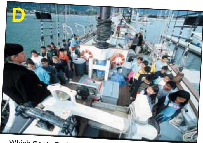
D Which Santa Barbara museum allows youth to stay overnight on a tall ship and travel back in time to become a 19th century sailor?