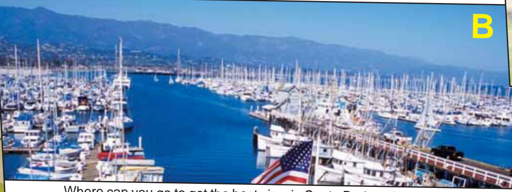
B Where can you go to get the best view in Santa Barbara?