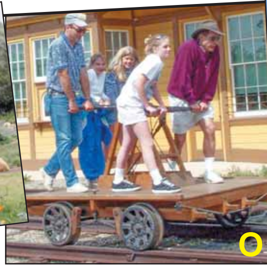
O Where can you ride this strange contraption?