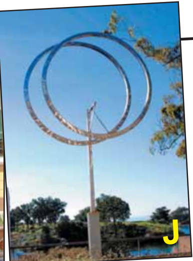
J Which museum, located next to a lagoon, has this sculpture of polished, rotating circles as its "mascot"?