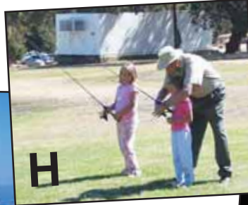
H Where would you go to learn how to fish at a Kids' Fishing Workshop or to catch fish in a swimming pool?