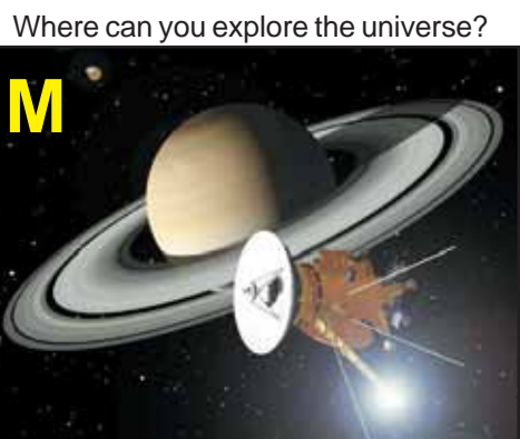
M Where can you explore the universe?