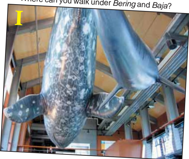
I Where can you walk under Bering and Baja?