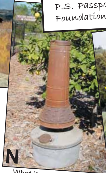
N What is a smudge pot?